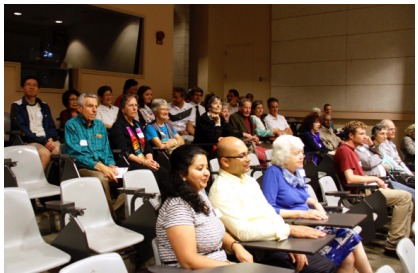
An engrossed audience