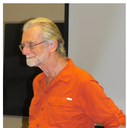
Chris Wills offers an amazing pictorial glimpse into life in Peru