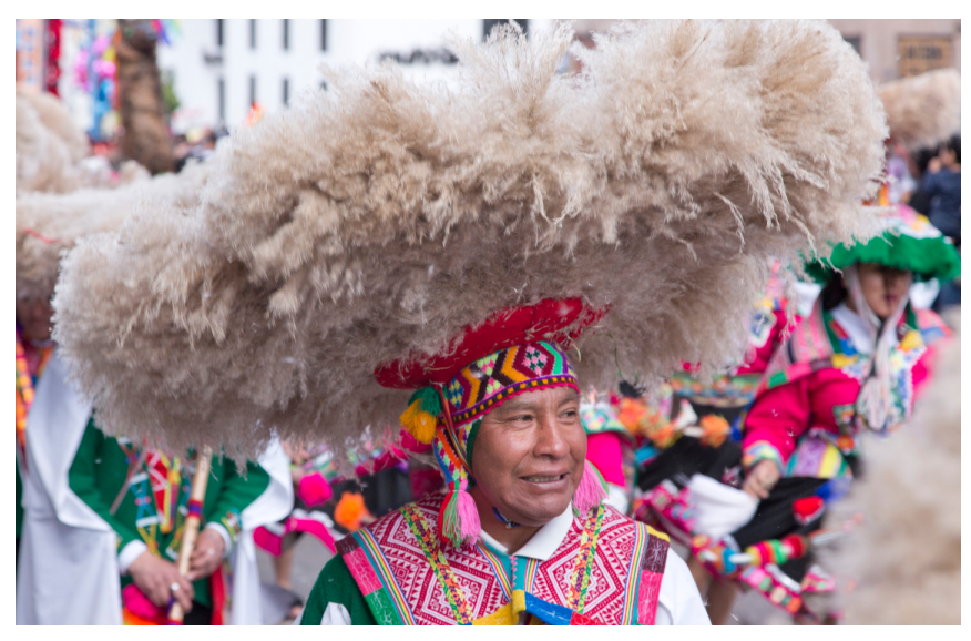
Civic parade in Cusco